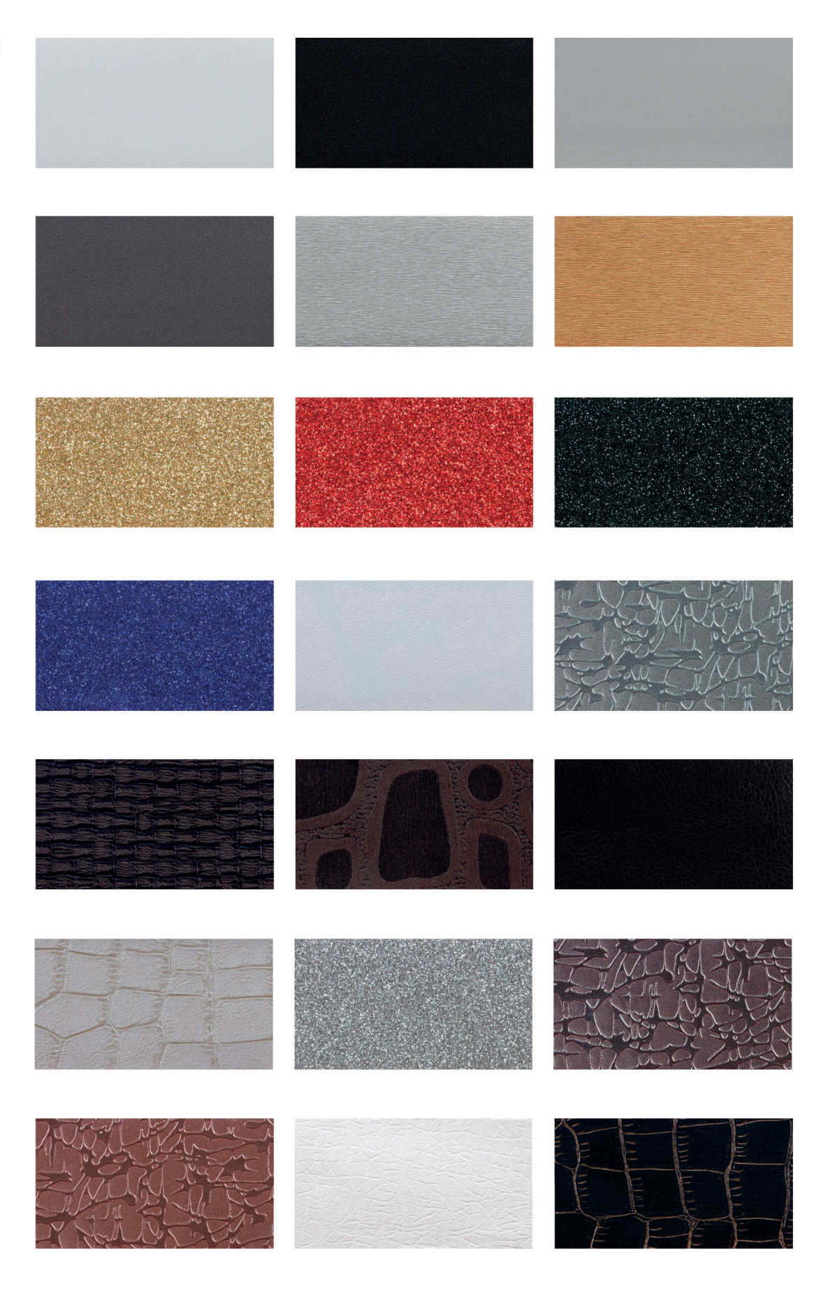
... ask for other styles we customized your Cash4Vip